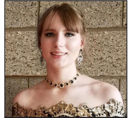
CORE CURRICULUM & BOOKS USED: